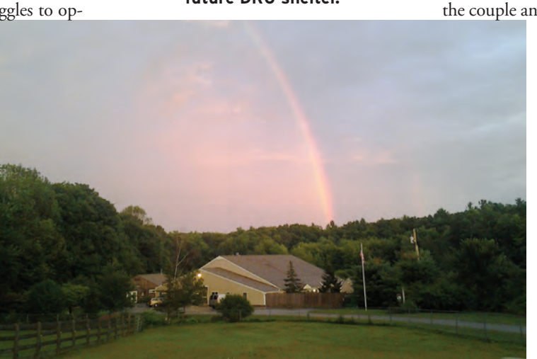
Since the DRU shelter opened its doors 15 years ago, over 2000 Dobermans have found new homes, medical care, training, kindness and peace.

As time went by, the couple came to understand the organization and the good work it did. Discussion was started about what it would take to build a shelter. Research was done. Fundraising strategies were analyzed and implemented. Architects were consulted. It was difficult to comprehend that the dream of having a shelter for Dobermans in need of rescue was actually taking flight. In Sandown, NH we found for sale the most beautiful hayfields bordered by natural rock walls and surrounded by tall aspens, oaks, maples and the occasional shagbark hickory tree. The land was purchased by the couple and a 14 acre parcel from it was do-