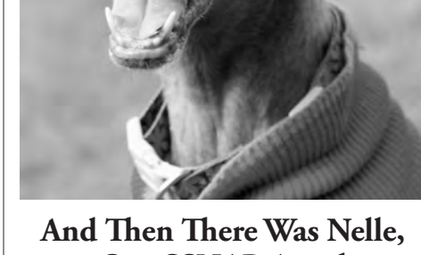
Our SSNAP Angel

And speaking of crossing that Rainbow Bridge, that's another subject I often hear as an excuse not to adopt or become a foster mom to a senior or special needs dog. People say, "How can you adopt an older dog knowing you aren't going to have him for many years?" Well, for me, it's not about that, it's about how much quality time I can give this dog for his or her remaining life, whether it's 10 years or 10 months. It's about making the rest of his life, the best part of his life.