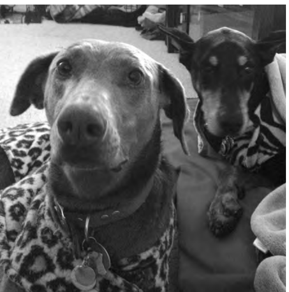
Rocky and Skye are quite a pair!

him a couple of weeks to start to feel secure and comfortable. As the weeks rolled by, more and more of his personality came out. Much to our delight, Rocky is quite a happy-go-lucky boy, goofy as a clown at times and quite the marshmallow at other times. He would lounge in your lap all day if you'd let him. I'd have to say his favorite pastime is getting massages from me...lots and lots of massages! Rocky did his best to be helpful with the housework, and I recall a couple of weeks after he came home, he was helping me with the laundry when I dropped